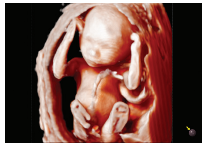
1st trim. with Realistic Vue™